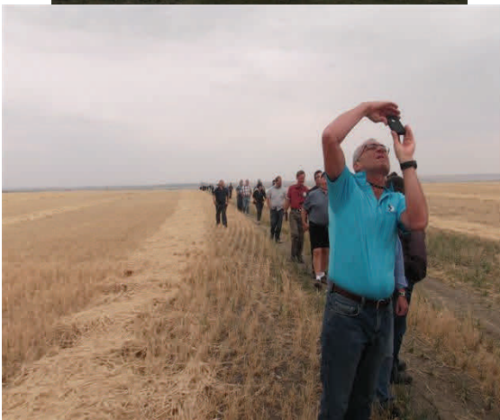
It was a hot hot day - till we got to Magrath where even taking a photo of the windmill was a challenge