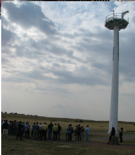
(Left) Lethbridge College's Wind Energy Training Program outdoor facility—the tower shakes in the wind.- imagine that for an entrance test! (Above) LCC's indoor wind energy training facility.